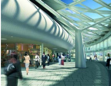
A visualisation of the station's western concourse by John McAslan + Partners, showing its relationship to the groundplane between St Pancras and the King's Cross Square site.