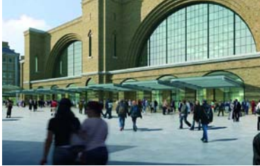
An indicative visualisation of part of the groundplane of the King's Cross Square site.

To create a new public plaza immediately south of King's Cross station, approximately 7000m 2 in area. The site is bounded by the Grade 1 listed King's Cross station to the north, by Euston Road and York Way to the south and east, and by Pancras Road and the Grade I listed St Pancras International station to the west.