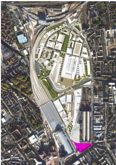
A general view of the King's Cross area, with the King's Cross Central development to the north, St Pancras International to the west, and King's Cross station to the south. The King's Cross Square site is highlighted in pink.

The historical provenance of the area around King's Cross dates back to the 4th century when Romano-British inhabitants established dwellings whose remains are associated with the nearby St Pancras old church. The 18th and 19th centuries saw the arrival of canals, then railways. These transformed what was then semi-rural King's Cross into an urban area of slums and workmen's lodgings: the nearby slum of St. Giles was the setting for Charles Dickens' novel, Oliver Twist . During the nineteenth century, this area was one of London's poorest districts, and its gritty reputation remained until the 1990s, when redevelopment of the area was outlined, through strategic urban studies, and through development schemes by Argent plc.