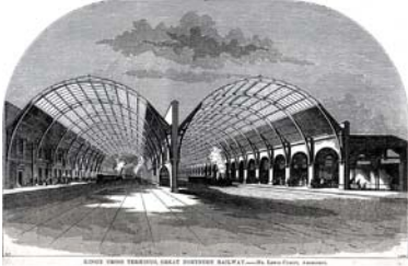
A mid-19th century perspective of the original double-vaulted train shed.

The historical provenance of the area around King's Cross dates back to the 4th century when Romano-British inhabitants established dwellings whose remains are associated with the nearby St Pancras old church. The 18th and 19th centuries saw the arrival of canals, then railways. These transformed what was then semi-rural King's Cross into an urban area of slums and workmen's lodgings: the nearby slum of St. Giles was the setting for Charles Dickens' novel, Oliver Twist . During the nineteenth century, this area was one of London's poorest districts, and its gritty reputation remained until the 1990s, when redevelopment of the area was outlined, through strategic urban studies, and through development schemes by Argent plc.