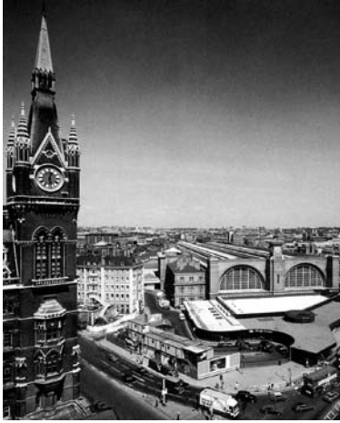
King's Cross station, prior to the start of its redevelopment scheme, with the area of the proposed King's Cross Square largely covered with the existing concourse and temporary structures.

King's Cross Square is destined to be one of the great public places in London. Against the magnificent backdrop of the Grade 1 listed façade of King's Cross designed by Thomas Cubitt, this new urban square will be the setting through which in excess of a hundred thousand commuters, visitors and residents will pass each day.