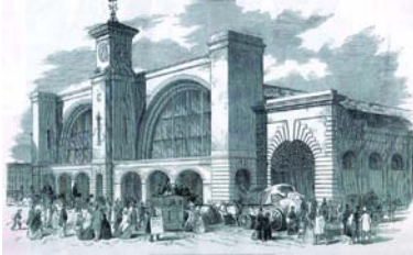
A contemporary depiction of the scene on the opening day of King's Cross station in 1852. The people and carriages are on what will soon become King's Cross Square.

The competition process is being managed by Malcolm Reading Consultants, in association with the Royal Institute of British Architects (RIBA) Competitions Office and Network Rail's lead architects for the King's Cross station redevelopment programme, John McAslan + Partners.