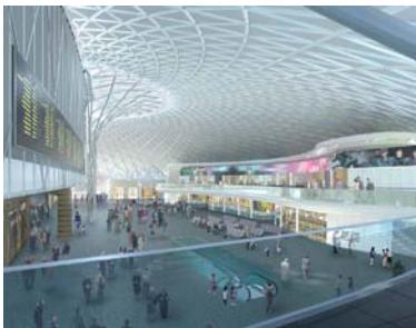
The scale and geometric drama of King's Cross station's forthcoming new western concourse, by John McAslan + Partners, will create the first piece of iconic railway architecture in the 21st century.

However, the new square needs to be viewed in wider strategic terms as a major London space that will also greatly benefit its local context. In particular, the successful designer will have addressed the question of how King's Cross Square might influence, or contribute to, future regenerative changes to Euston Road, and along its southern margins. A wider design context is thus suggested on the location plan, and the successful designer will want to address features within this that are capable of change, particularly the Underground entrances on the south side of Euston Road.